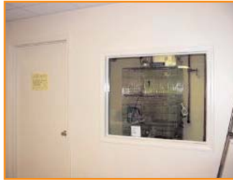
BEFORE Troop 21340